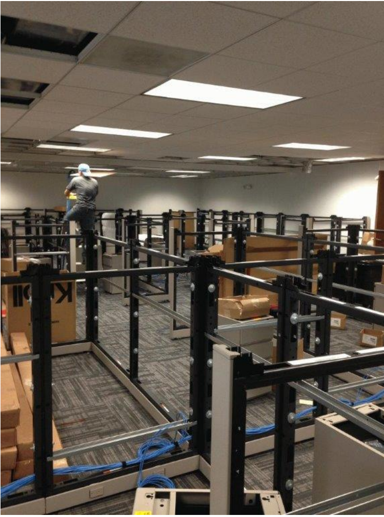
Frames being installed